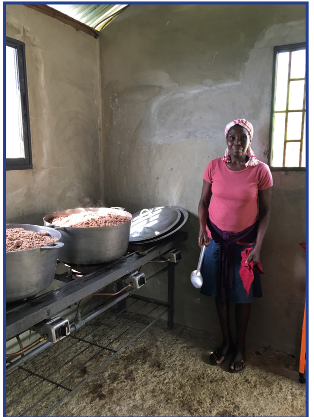
One of the cooks in their kitchen preparing the meal