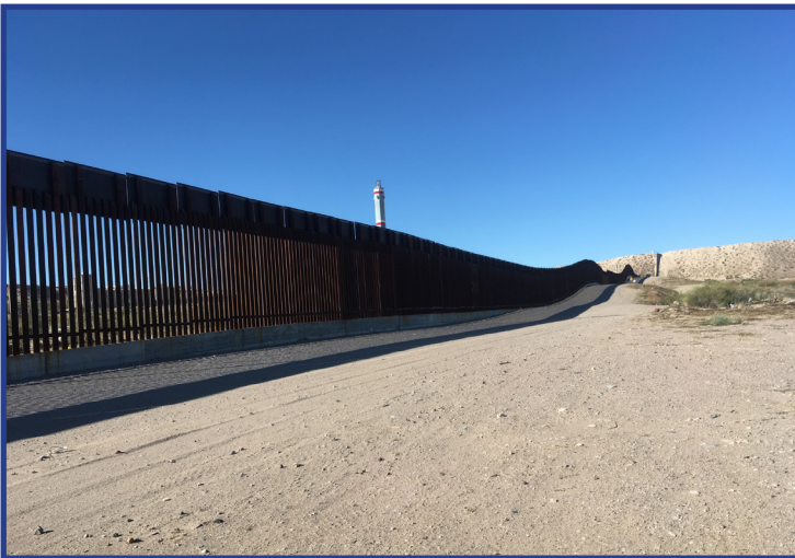
The border between Juarez, Mexico and El Paso, TX.