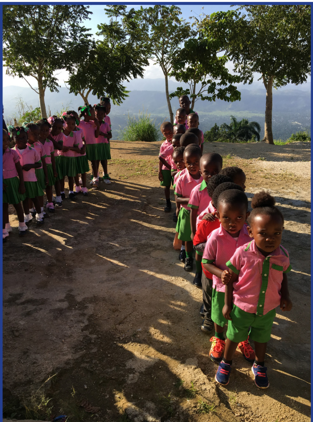
Kindergartners at the flag raising ceremony