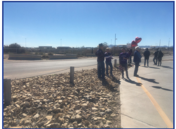
Interfaith Vigil at Tornillo Children's Detention Center.