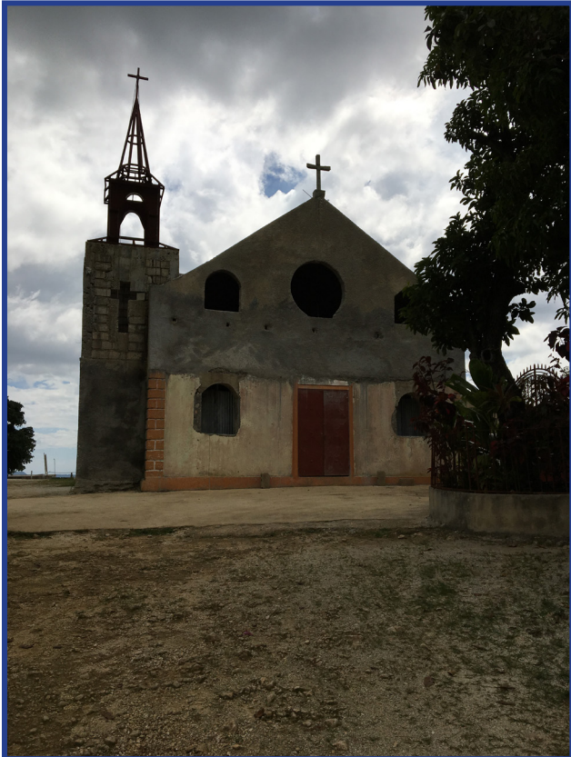
St. Rafael's Church