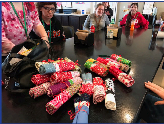
Servite Stitches-n-Stuff pillowcases

The group has just finished its most current project in honor of Valentine's day. They have just completed personalized Valentine pillowcases for our newest neighbors, Sheltering Tree.