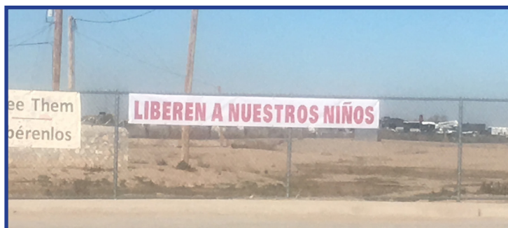
"Let our Children Go"