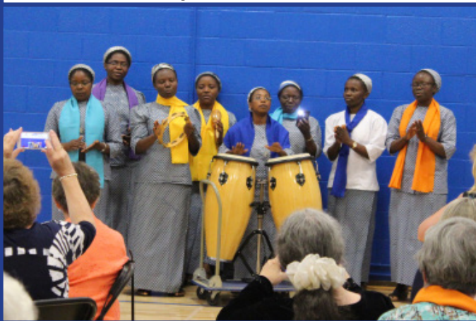
The Congolese Sisters performed the prayer before the Luncheon