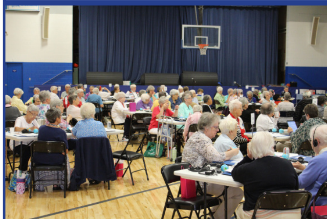
One of the sessions during the Assembly