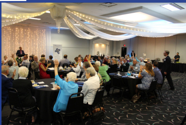
The Sisters were asked to raise their hands to be recognized during the ceremony.