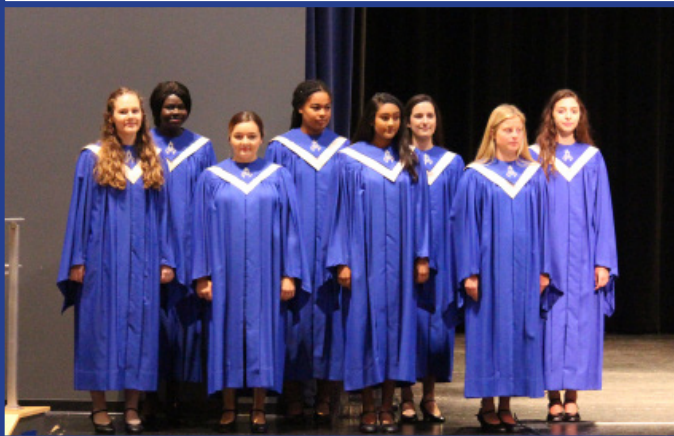
Marian's Select Choir performs the Servants of Mary song during the celebration Mass