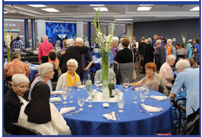
Photo from the Luncheon