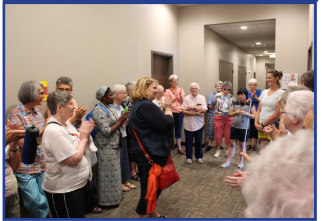
Many of the sisters went to Sheltering Tree for a tour