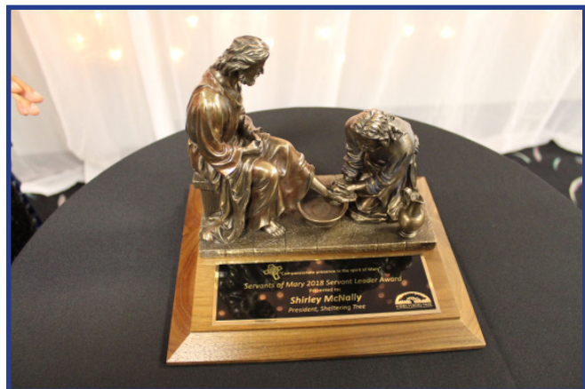
The Servant Leadership Award