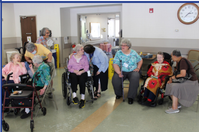
The Sisters had a wonderful time visiting with our sisters that reside at Immanuel Fontenelle