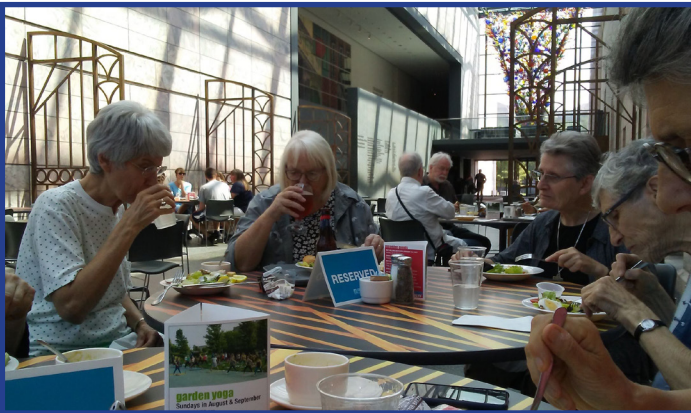
During the free day Sisters went to the Joselyn Art Museum

As the Servants of Mary remember 125 years of compassionate partnering in the United States, we recall all the wonderful people with whom we worked and the continual challenge to follow Mary's example of strength and wisdom, for this we pray