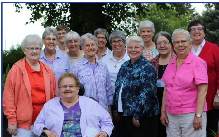
Servants of Mary from Omaha