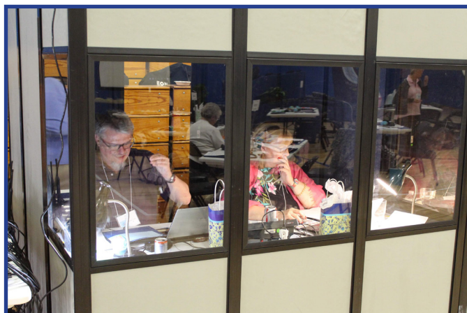
The booth that the Translators used during the Assembly