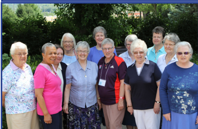
Servants of Mary from the United Kingdom