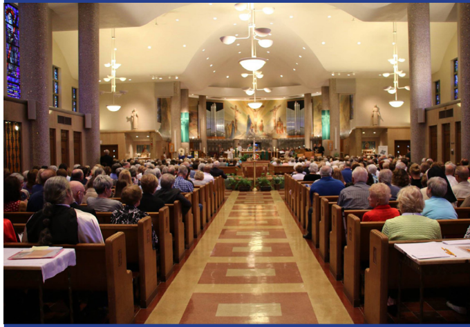
Nearly 750 people attended the 125th Celebration in Detroit