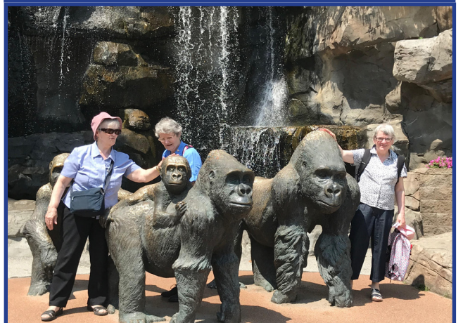
There was some monkeying around on the free day