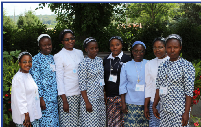
Servants of Mary from the Congo