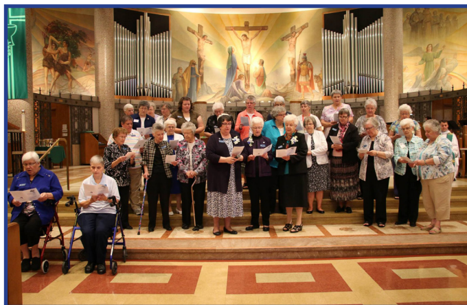
All the Servants of Mary Sisters and Associates at the 125th Celebration in Detroit