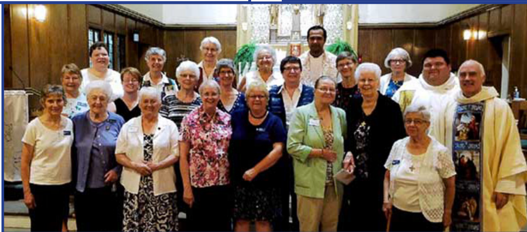
The 125th Celebration in Massena, New York