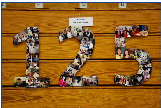
A photo collage made by the Associates in Portland