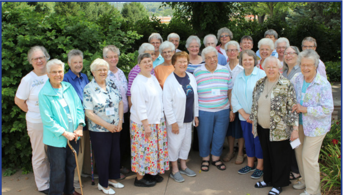
Servants of Mary born in Detroit