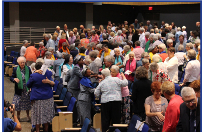
The sign of peace during the Anniversary Celebration