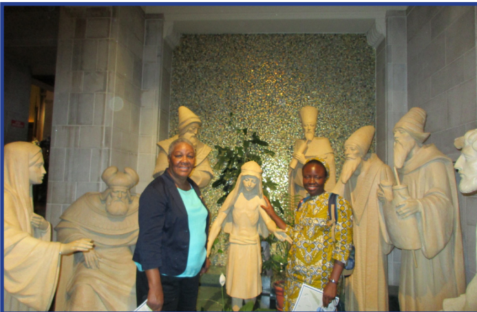
During the free day Sisters went to the Joselyn Art Museum