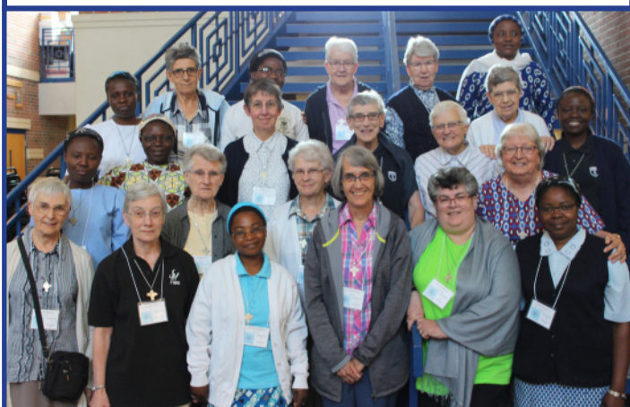
Servants of Mary from France, Belgium, Canada and the Congo