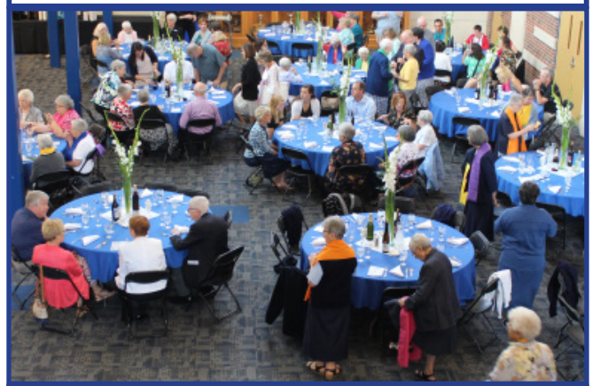
A Luncheon followed the Anniversary Celebration