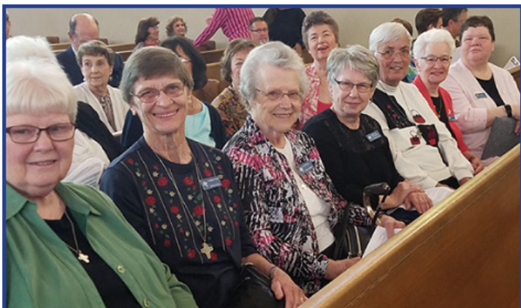
The 125th Celebration in Denver