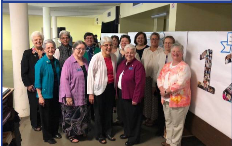
The 125th Celebration in Portland, Oregon