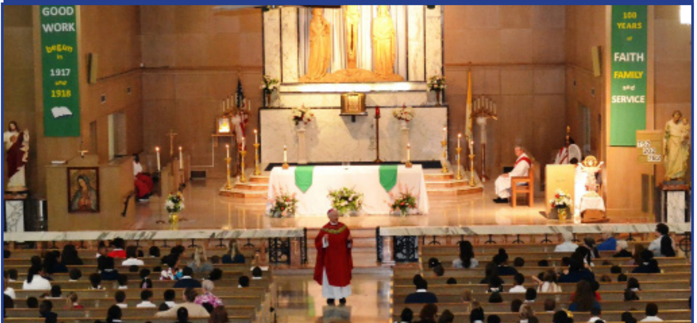
Sisters celebrated the 100 Anniversary of Holy Name School in Omaha