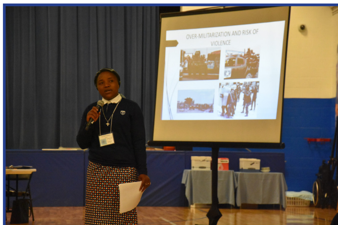
A Congolese Sister giving a presentation during the Assembly