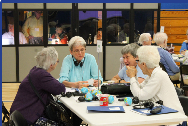
Sisters had many discussions throughout the day