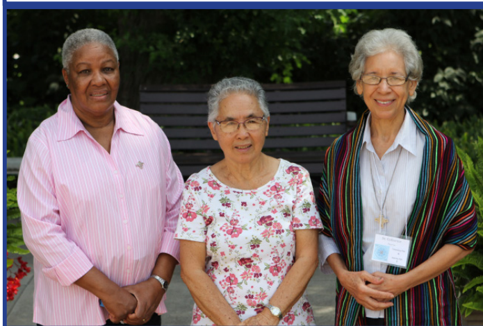
Servants of Mary from Jamaica