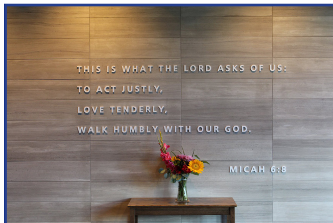
Micah 6:8 is scripted on the back wall of the Chapel.