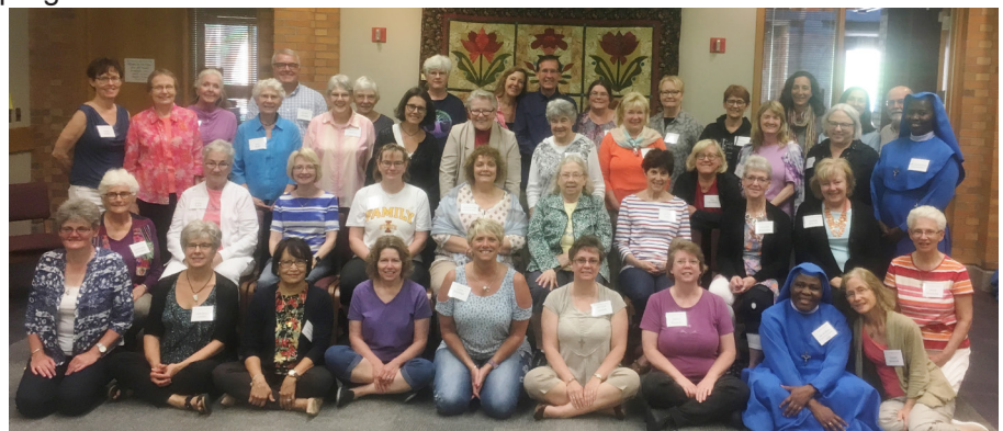
2019 Boundless Compassion Retreat