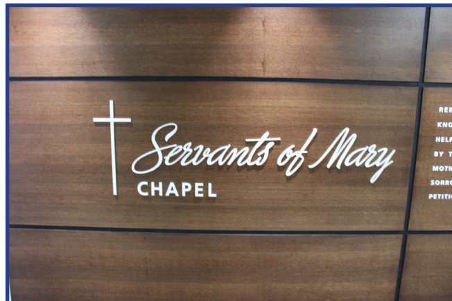
Entry of Marian's Servants of Mary Chapel