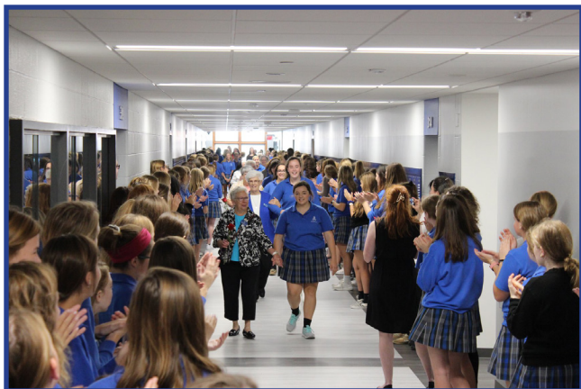
Marian students created an honor guard and applauded as the Servants of Mary walked to the new Servants of Mary Chapel.