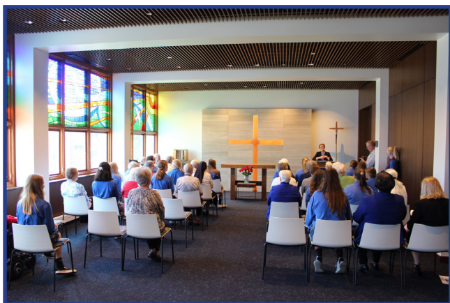
The new Servants of Mary Chapel.