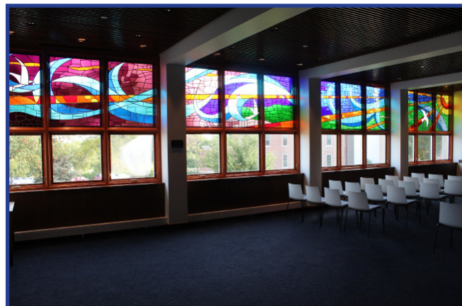
The stain glass windows are a representation of a student's journey at Marian.