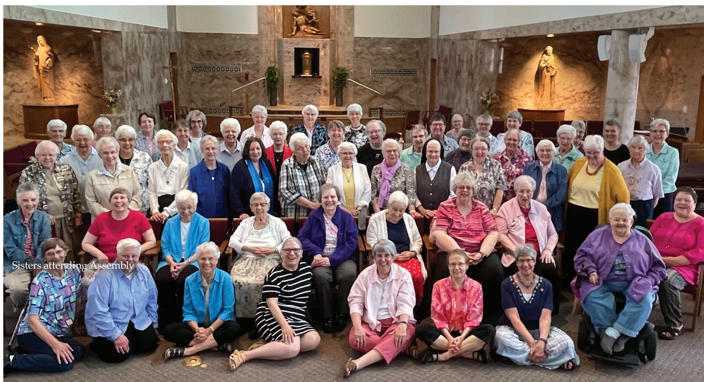
Sisters attending Assembly