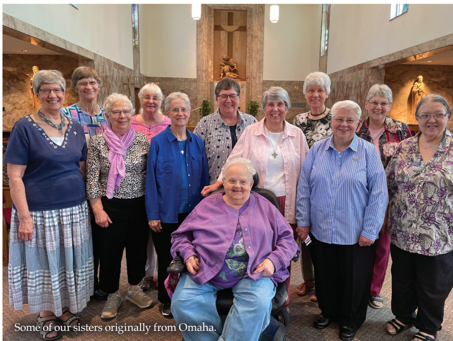
Some of our sisters originally from Omaha.