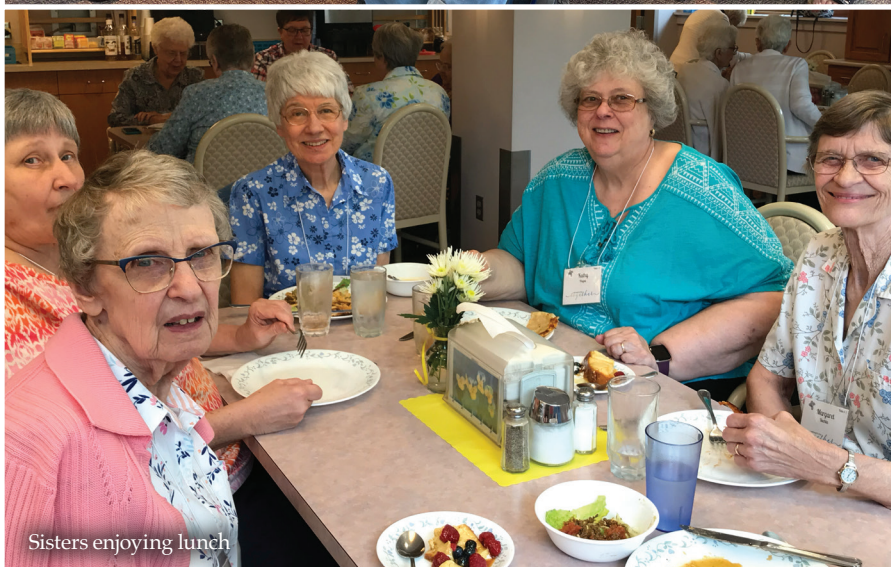
Sisters enjoying lunch