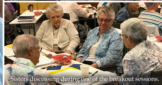
Sisters discussing during one of the breakout sessions.